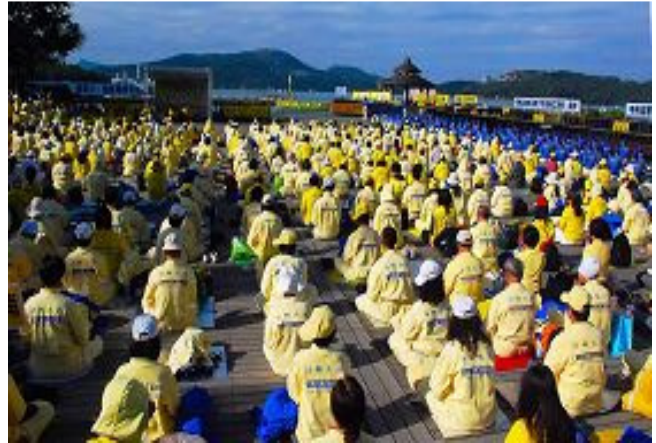
More than 1,000 practitioners meditate on De Hua Pier, calling for an end to the persecution.