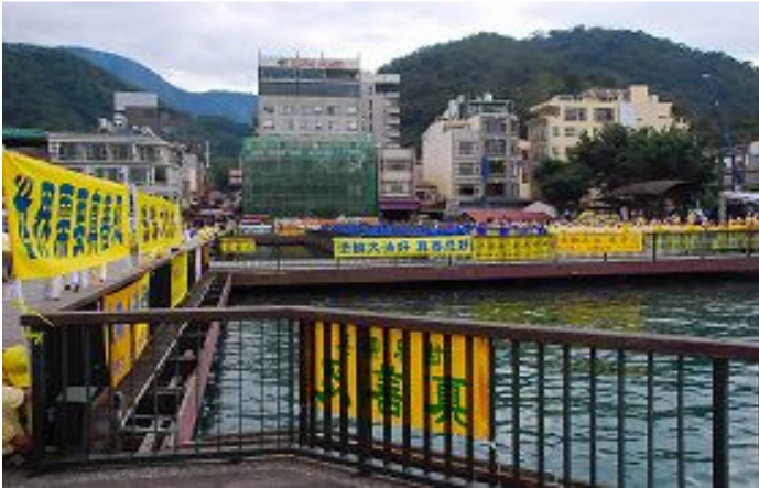
Falun Gong banners are displayed everywhere along the piers, during Chen Yunlin's visit to Sun Moon Lake

(Clearwisdom.net) Chen Yunlin, chairman of China's Association for Relations Across the Taiwan Strait (ARATS), was scheduled to visit Taiwan's Sun Moon Lake on December 24, 2009. Falun Gong practitioners used this opportunity to stage a peaceful protest and call for an end to the brutal persecution in China. Practitioners arrived at Sun Moon Lake early in the morning and displayed banners reading, "Stop the Chinese Communist Party's persecution of Falun Gong," and, "Falun Dafa is good" at the entrance to the park and major piers.